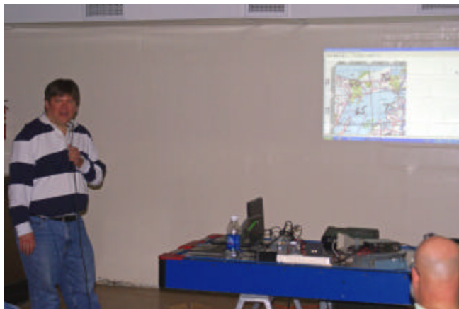
AA9IL Microwave Presentation