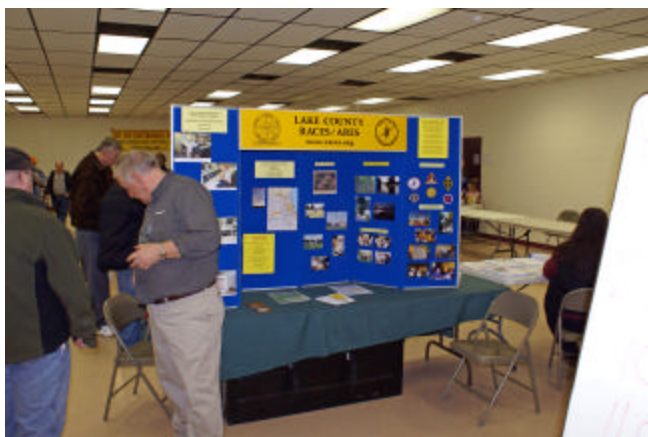
Lake County Races booth.

One service we again provided was VE Testing. This time our VE Team managed to license one new ham and one upgrade to General, congratulations to N9KTL on his upgrade to General. We also had two attempts at Extra Upgrades and one General upgrade. The VE team looks forward to seeing those that didn't get their upgrades at future VE testing sessions.