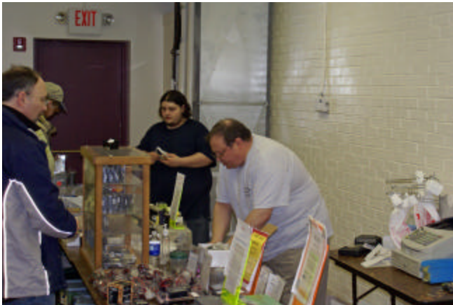
DC – Ace

First concern was getting the vendors in, to our surprise they loved the invite and really made it worth while for all concerned.