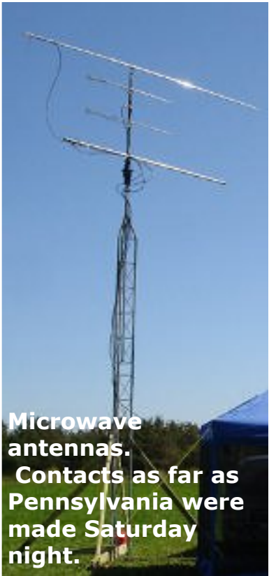
Microwave antennas. Contacts as far as Pennsylvania were made Saturday night.