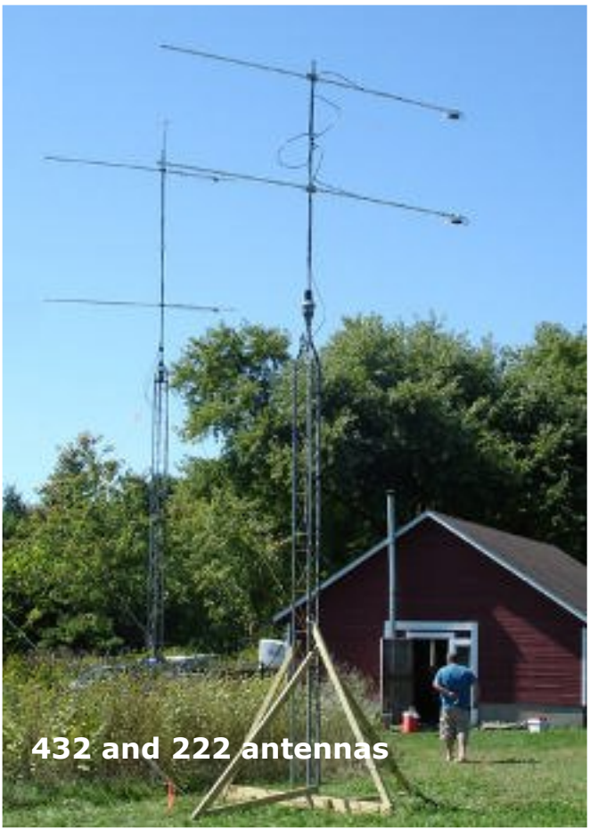
432 and 222 antennas