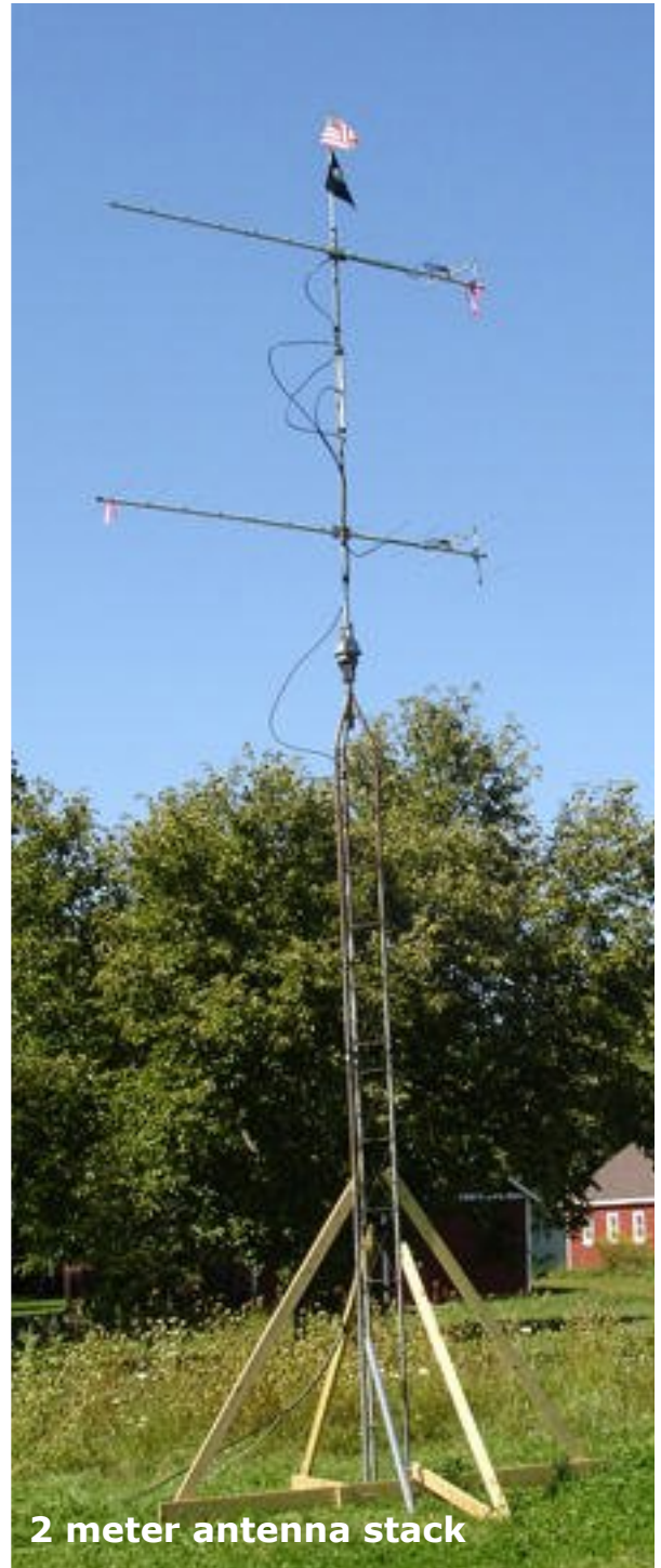
2 meter antenna stack

The band conditions from 2 meters to 1296 were to say the least outstanding. Saturday night saw contacts on 2 through 432 well into the FN grid squares. Something that we had never attained before. Comparing scoring from past years, 2008 was rained out, 2007 our score was ~62,000. This was surpassed this year with a total score of 88,578 an over 20K improvement. So you ask what did we do so right this time? The answer is a bit